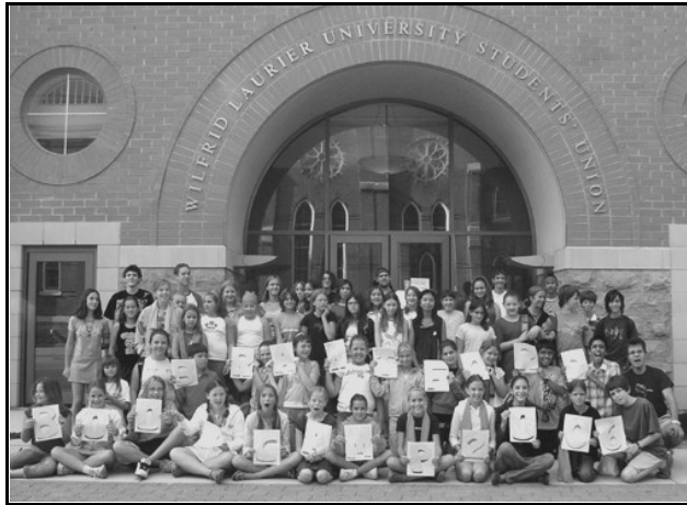
Brantford Book Campers 2006